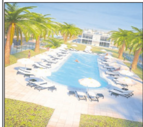
Sunny disposition: body time in Cape Verde