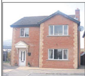
City slickers: des res in Belfast