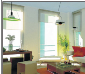
Talking Turkey: stylish bothole in Istanbul