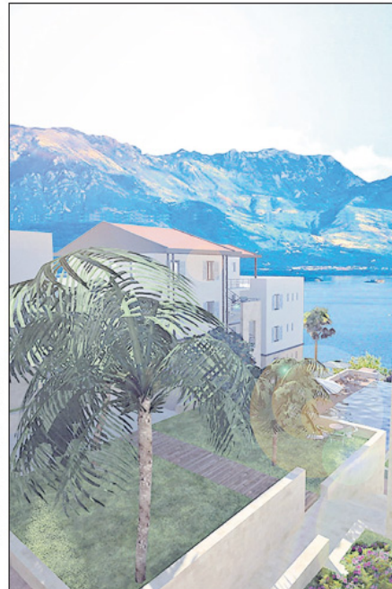
Mountain view: Acacia Hills in Montenegro

The Palm View Resort, which is set on the stunning white-sand Praia de Chaves beach, has been awarded six star by the Cape Verde government, re-